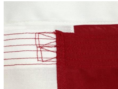
Flyend with 6 rows of stitching and double X-Box