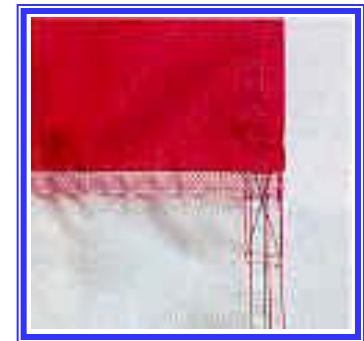
Flyend with 4 rows of stitching and an X-Box