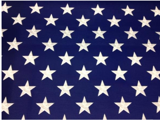
Embroidered Stars 2x3' – 20x38'