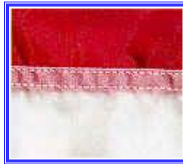
Unidirectional ¼" Chain Stitch Stripe Seams