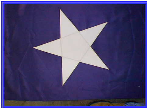
Die Cut Stars 30x50' and Larger